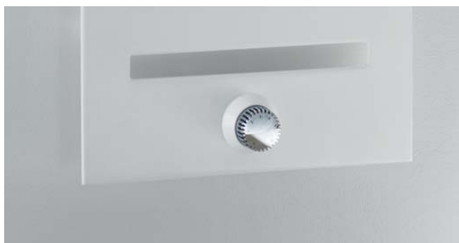
Completo version with integrated valve